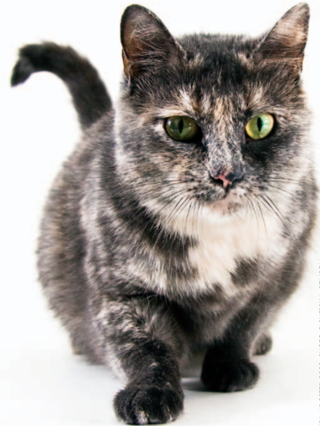
HEIDI, ADOPTED 2009. PHOTO © SHERRY L. STINSON